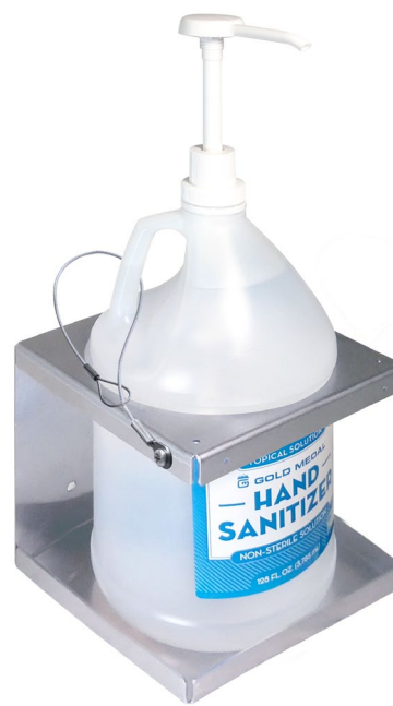
Gallon jug with pump shown for reference only (not included with unit).